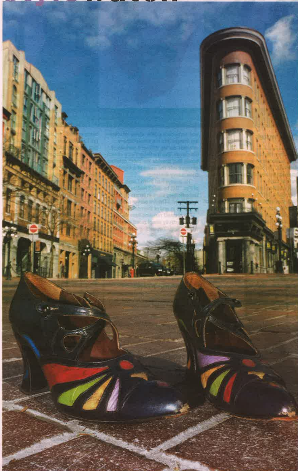
These stained-glass-effect pumps by Peter Fox for Fox & Fluevog, circa 1973, could probably tell a tale or two, as could the other wild footwear at the Museum of Vancouver's new show, Fox, Fluevog & Friends: The Story Behind the Shoes.