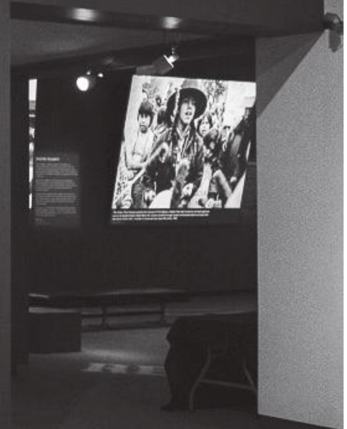
10 TIPPED POLICEMAN on horseback pushes and huddled in entrance to building at 5