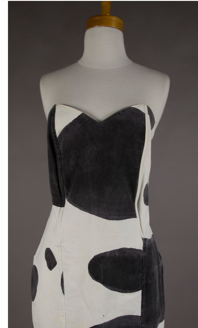
H2017.6.11 Bovines costume, 1980s

In 2017, MOV digitized artifacts related to early Vancouver industry artifacts and BC archaeology. Due to the small size of many of the archaeological specimens, we were able to digitize at a greater pace than previous years. At project's end, the digitization technician had completed the photography of 10,290 objects resulting in 20,580 photographs uploaded to the museum's online, publicly accessible database, openMOV.