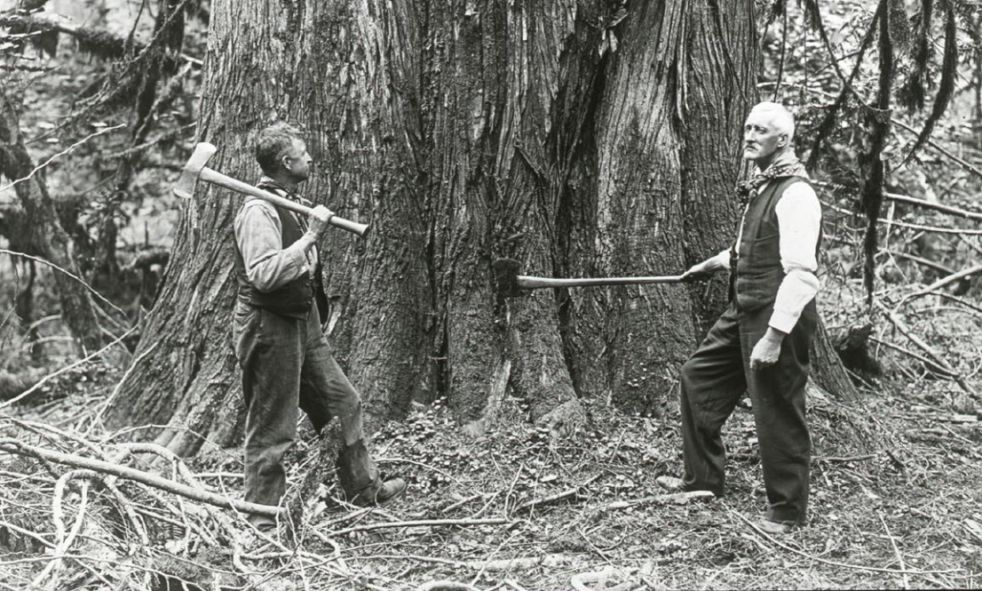
H2017.26.45 Glass slide, 1910s